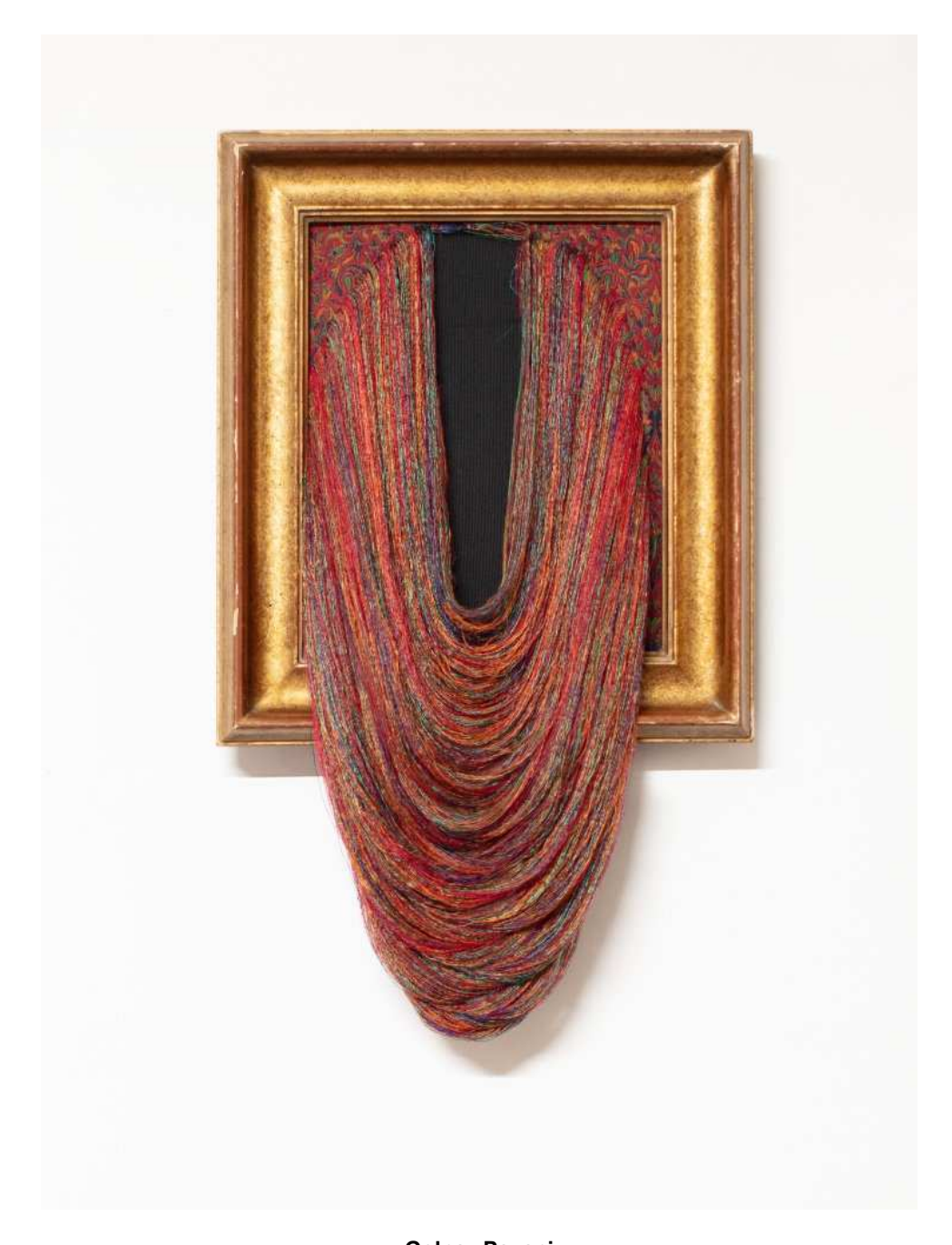
Golnaz Payani The Portrait 01, 2023 wool and silk fabric, painted wooden frame 23 5/8 x 13 3/8 in 60 x 34 cm (GP23MM12)

PRAZ-DELAVALLADE LOS ANGELES 6150 Wilshire Blvd, Los Angeles CA 90048 +1.323.917.5044 losangeles@praz-delavallade.com